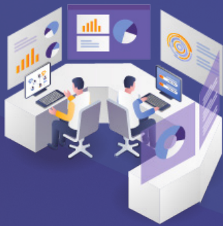
Safeguard CUI in a Secure Space

Need to meet NIST SP 800-171 controls for CMMC Level 2? Exostar's Managed Microsoft 365 has you covered! Simplify your security management and collaborate efficiently within a Microsoft Teams environment—all without breaking the bank.