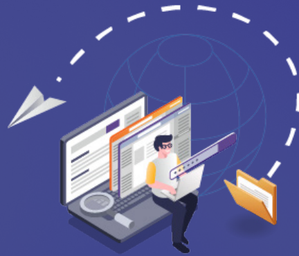
Securely Email CUI