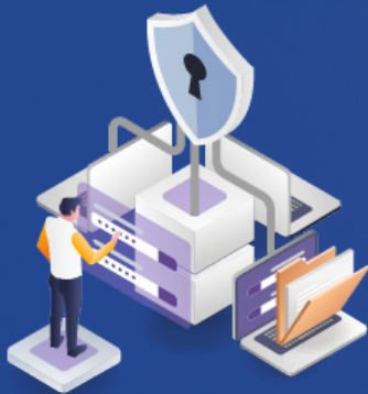
Affordable & Scalable Subscription